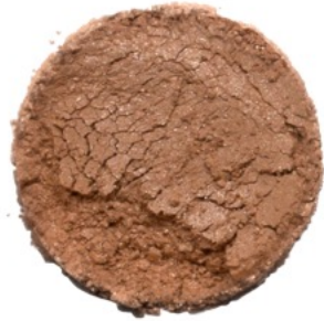
501 - Summer Loved (Warm brown)