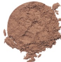
301 Dark No.2