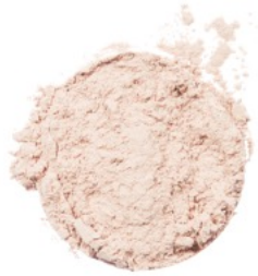
100 Cool No.1