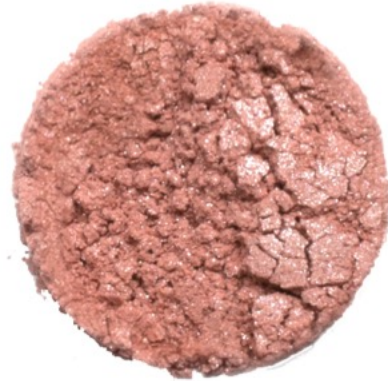
503 – I Do Believe You're Blushin'