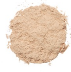
201 Warm No.2