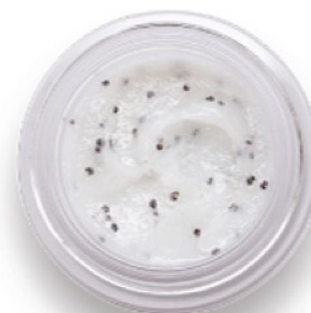
Poppy Seed Lip Scrub