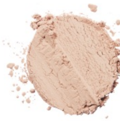
102 Cool No.3