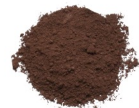
304 Dark No.4