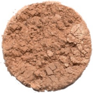
500 - Crowned All Over (Medium nude)