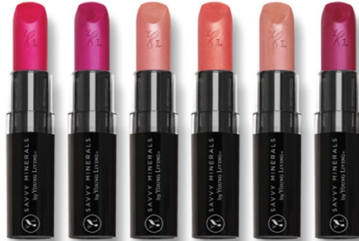
Mic Drop (Bright pink) Sweet Life (Bright fuchsia) It Girl (Pale pink beige) I Dare You (Coral orange) Miss congeniality (Soft pink) Bedazzled (Plum berry)