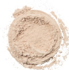
200 Warm No.1