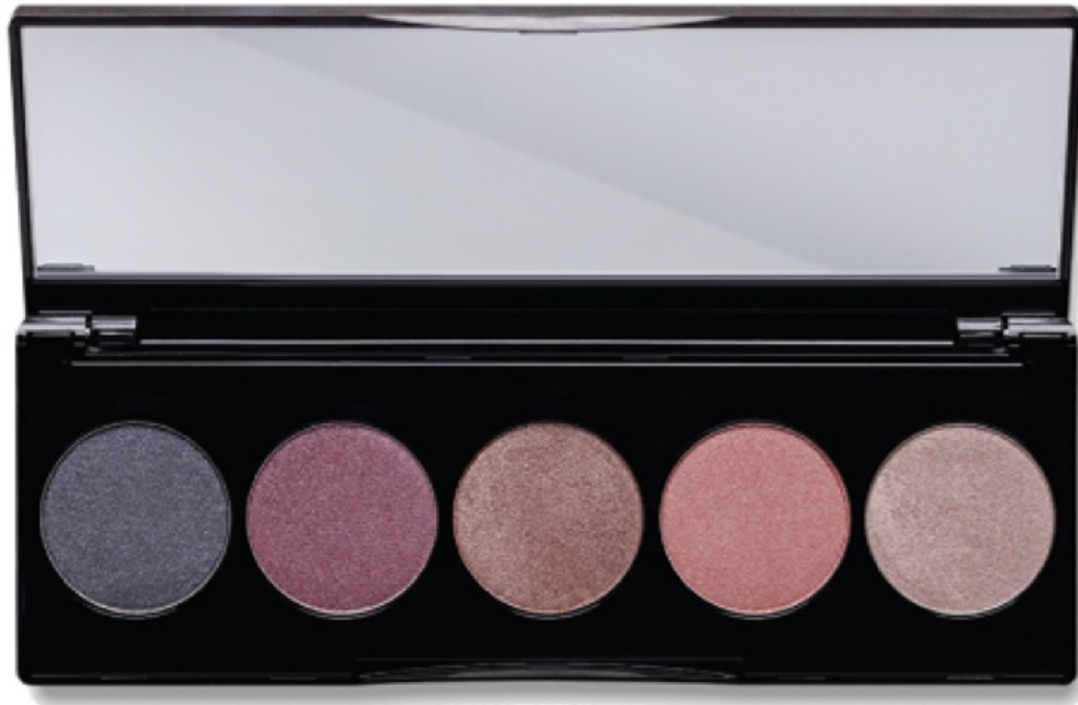
No. 1 Palette shades:

Ambition (Deep charcoal shimmer) Timeless (Mauve shimmer) Elegant (Bronze shimmer) Chic (Rose pink shimmer) Charm (Cream shimmer)