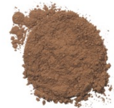
302 Dark No.3