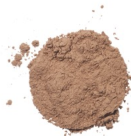
300 Dark No.1