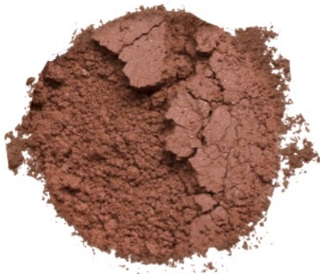
502 - Passionate