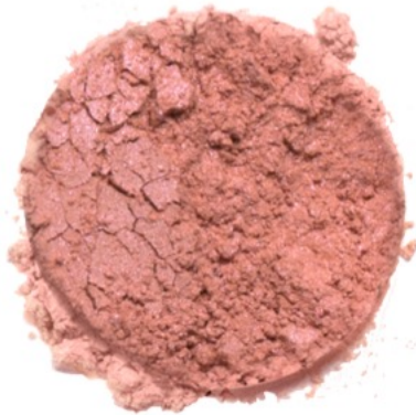
504 - Smashing