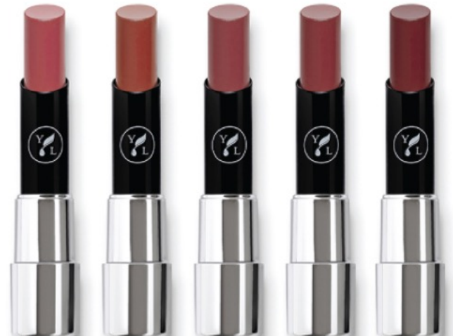
Icon (Dark pink) Muse (Copper brown) Untamed (Deep raspberry) Posh (Red burgundy) Siren (Cool plum)