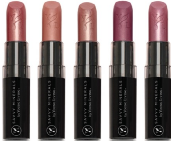
Adore (pink neutral) Daydream (pale peachy nude) On a Whim (beige nude) Uptown Girl (dusty rose) Wish (nude rose)