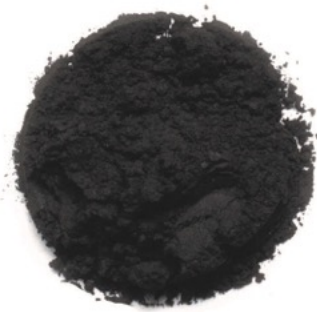
408 - Jet Setter (Matte black)