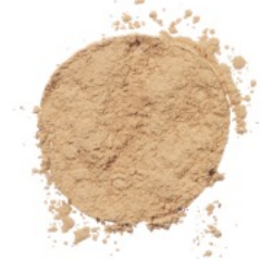
202 Warm No.3