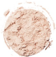
101 Cool No.2